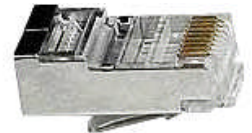
Shielded RJ45 Plug