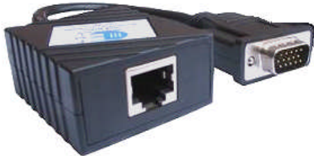
PC Balun Part No: E10680C