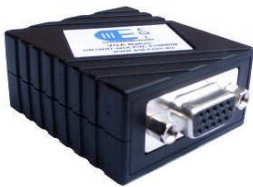
Monitor Balun Part No: E10680M