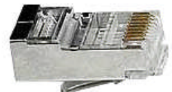
Shielded RJ45 Plug