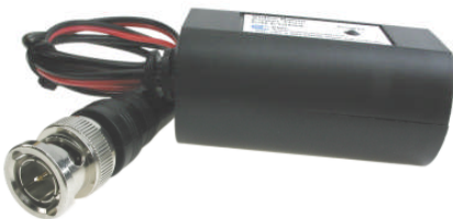
Power Through Video Balun BNC Male to RJ45 Jack with 300mm lead Part Number: E10524