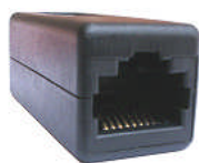
Rear View of E10190R

The video balun will enable video signal to be interfaced using coaxial on one side to Cat 5 twisted pair cabling on the other using modular RJ45 connectors to achieve quick and reliable connections.