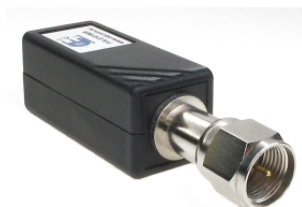
Video Balun F Male to RJ45 Slim Part Number: E10190R