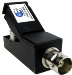
Quick Connect Video Balun BNC Female to IDC Part Number: E10185C