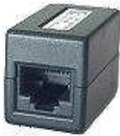
Rear View of RJ45 Jack