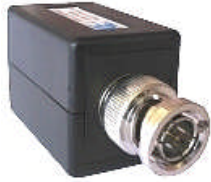
Video Balun BNC Male to RJ45 Part Number: E10184S