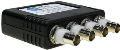
Quad Power Through Video Balun 4 x BNC Female to 4 x RJ45 Jack Part Number: E10174

Note: Specifications subject to change without notice.