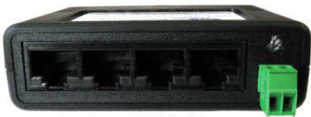
Quad Power Through Video Balun Rear View