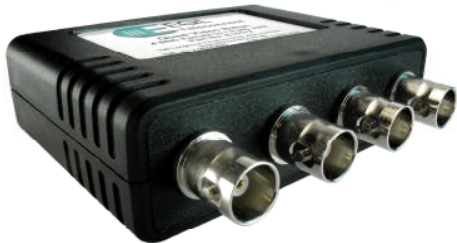
Quad Video Balun BNC Female Part Number: E10172