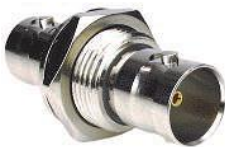
BNC Female BNC Female Bulkhead Adaptor Isolated