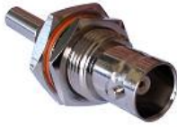
BNC Female Straight Crimp Bulkhead