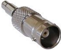
BNC Female Straight Crimp